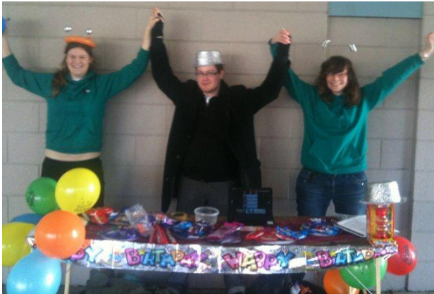
Leeds Atheist Society raising money for Darwin Day.

You must provide evidence of donating the money. This could be in the form of a photograph of a cheque, a print screen of the donation or a JustGiving page.